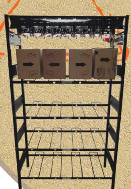
Each rack shelf provides storage for up to four (4) Bag-In-Box (BIB) boxes!

We customize and configure CUSIC BIB Rack Systems to fit your need. With over 30-years experience, we specialize in it.